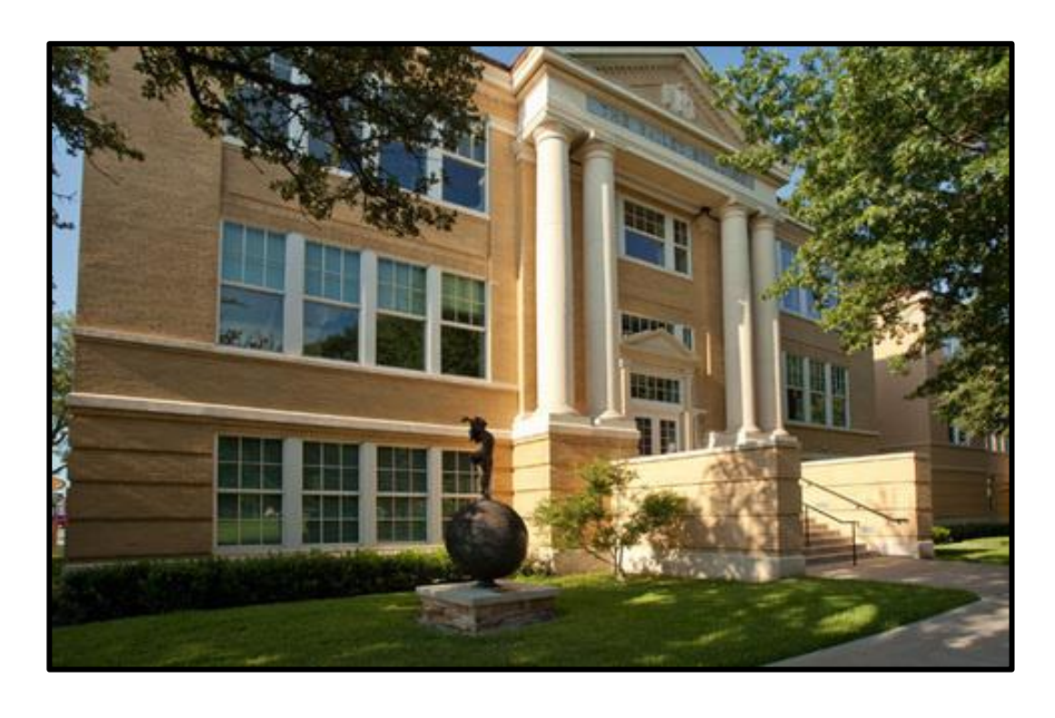
Educator Preparation Undergraduate Handbook